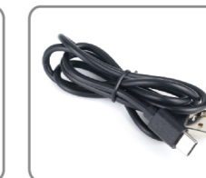
Type-C charging cable